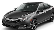
Modern Steel Metallic