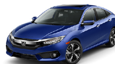
Brilliant Sporty Blue Metallic