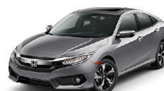
Lunar Silver Metallic