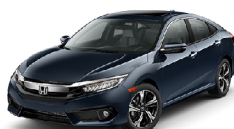
Dark Bluish Gun Metallic