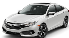
Orchid White Pearl