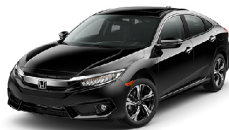
Crystal Black Pearl