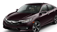
Midnight Burgundy Pearl